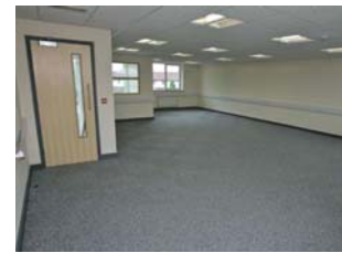
Cuerden Business Village - Warden

The works were completed within the Main Contractors specified programme of works.